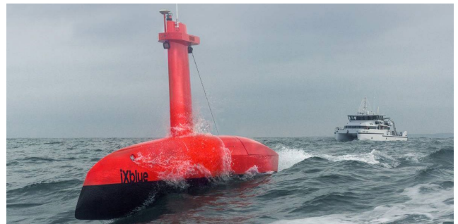
NOAA's Office of Coast Survey and the University of New Hampshire's Center for Coastal and Ocean Mapping/Joint Hydrographic Center are working with iXblue to evaluate the "DriX" USV as a force multiplier by working in tandem with research ships to increase rates of ocean-bottom mapping.

Partnerships with industry to research and develop the design and use of UxS is a key provision in CENOTE and can be expanded through multiple mechanisms. These include CRADAs, increased use of NOPP, Small Business Innovation Research grants, contracts, cross-agency agreements, and other vehicles as appropriate to increase and accelerate collaborations, support commercialization, assist with assessments of commercially available UxS, and participate in cooperative investigations. Iterative demonstrations and field trials of industry technologies, and evaluation of acquisition alternatives, e.g. government owned/operated, industry owned/operated, leasing, and data or product buys have proven successful and important. Through these collaborations, NOAA will also grow advocacy and awareness of UxS mission priorities.