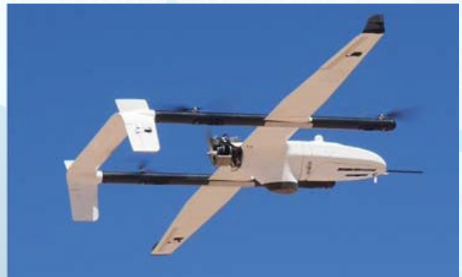
The L3 Latitude is a hybrid quadrotor UAS that combines vertical takeoff and landing with the speed and range of a fixed-wing aircraft. NOAA is testing it for launching from a ship for climate and air quality studies, fishery and mammal surveys, weather observations, oil spill detection, and post severe weather damage assessments.

To ensure the NOAA Uncrewed Systems Strategy realizes transformational advances in performance, skill, and efficiency, NOAA is developing a companion UxS Strategic Implementation Plan or "Roadmap" that will define detailed action items, deadlines, and responsibilities scaled to potential available funding levels. Meanwhile, NOAA's use of uncrewed systems is already significantly improving performance in our lifesaving and economically impactful missions, and setting the course to strengthen our renowned environmental science and technology leadership for the coming decades. Together with our advances in NOAA's other science and technology focus areas—AI, 'Omics, and Cloud Computing—NOAA will achieve our top agency priorities to regain global leadership in numerical weather prediction and sustainably expand the American Blue Economy.