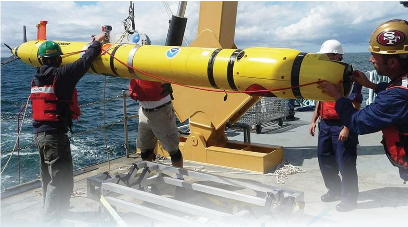
NOAA Ship Ferdinand R. Hassler crew recover the Office of Coast Survey's Hydroid REMUS 600 UUV after completion of a bathymetric mapping mission. This vehicle can operate for 20+ hours at depths up to 450 meters while maintaining acoustic communications with the host ship.