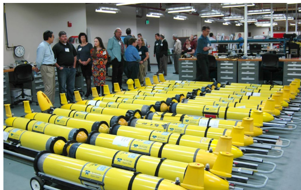
NOAA's U.S. Integrated Ocean Observing System Program partnered with the U.S. Navy and Shell Oil Co. to share data from over 20 gliders deployed in the Gulf of Mexico in 2018. Salinity and temperature data from gliders can improve hurricane intensity forecasts.

Formal concepts of operations (CONOPS) describing UxS operational applications to NOAA mission priorities will ensure efficient and reproducible operational methods, including flexibility to adapt and align to potentially radically different approaches like working beyond line-of-sight or operating swarms of platforms. CONOPS may also describe allocation pools to share UxS assets similar to provisioning of NOAA ships and aircraft to help ensure the greatest number and highest priority of mission requirements are satisfied. Integrating these diverse operational modes into an overall NOAA UxS CONOPS will improve consistency of operations, and provide a template for partner organizations. The CONOPS will include language that states NOAA will operate UxS assets in a safe and secure manner in compliance with all relevant environmental laws, ensuring that operations do not interfere with individual privacy rights or adversely